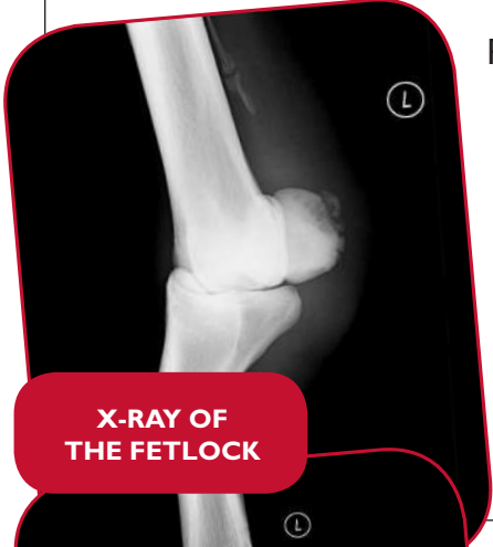
X-RAY OF THE FETLOCK

Radiographs – x-rays are taken by the veterinary surgeon to assist in diagnosing conditions relating to both the skeleton and soft tissues of the horse. Conventionally, x-rays have been taken using ionising radiation which is captured on a film. The varying densities of tissues in the patient absorb some of the radiation so the x-ray film is exposed to different degrees. The film is developed rather like traditional film camera processing to give a black and white image. Many modern systems now produce a digital image with no need for film. These images can be digitally manipulated to aid diagnosis.