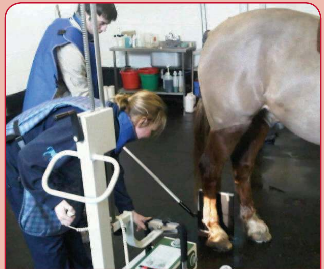
TAKING A FETLOCK X-RAY