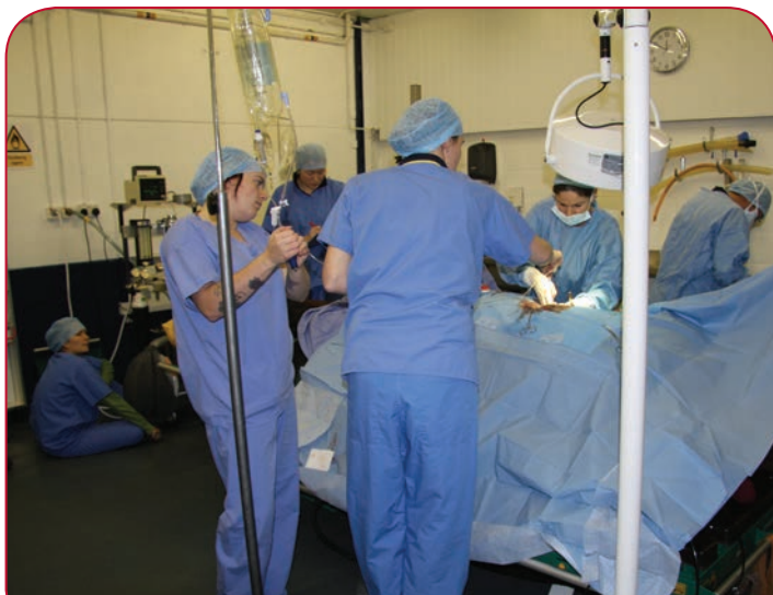
MOST RIG CASTRATIONS REQUIRE A GENERAL ANAESTHETIC FOR SURGICAL REMOVAL