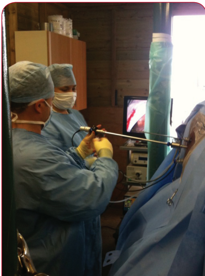
STANDING “KEY HOLE” SURGERY CAN ALSO BE USED TO SURGICALLY REMOVE AN ABDOMINAL TESTICLE

If an abdominal testicle is identified it can be removed under general anaesthesia or understanding sedation by laparoscopy, using specialist “key-hole” surgical equipment.