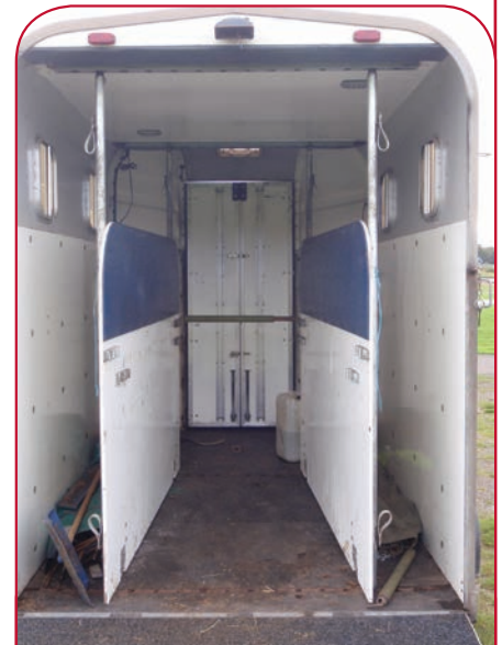
A HORSE AMBULANCE PROVIDES A LOW RAMP AND SUPPORTING PARTITIONS FOR EASE OF LOADING AND TRANSPORT