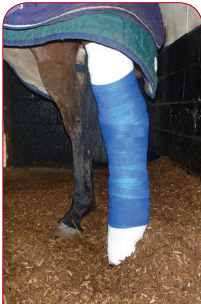
LOWER LIMB FRACTURES CAN BE STABILISED WITH A SPLINT OR CAST

Whether your horse will return to soundness following treatment is very dependent on the type of fracture and response to treatment. Your future expectations for your horse may also affect the decision to treat a fracture.