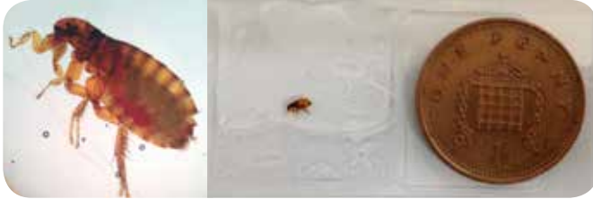
A flea seen under the microscope

Although they are small they can be seen with the naked eye and are about 1-3 mm long. They have flat bodies and very powerful back legs which mean they can jump huge distances for their size.