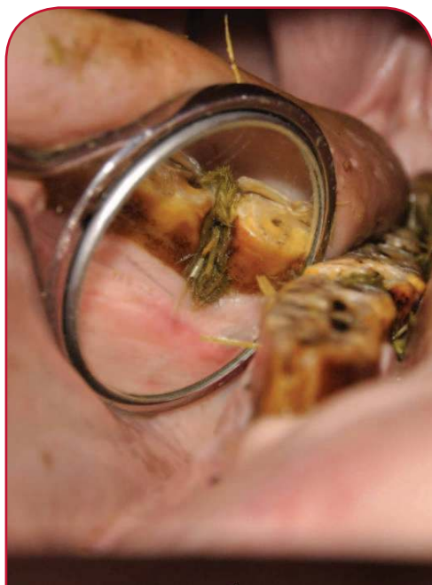
A DIASTEMA CONTAINING FOOD MATERIAL

Signs seen include bad breath (halitosis), quidding (dropping food), weight loss and pouching of food in the cheeks. Affected horses are also more likely to develop choke and impaction colic due to poor chewing of fibre.