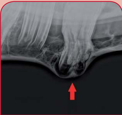
X-RAY OF AN ERUPTION CYST ON THE LOWER JAW

All horses should receive routine dental care at least once a year to prevent sharp enamel points forming which can cause trauma to the soft tissues of the mouth. As part of this care your veterinary surgeon will carry out a thorough oral examination; this can aid early identification of dental problems that may require further advanced dental care.