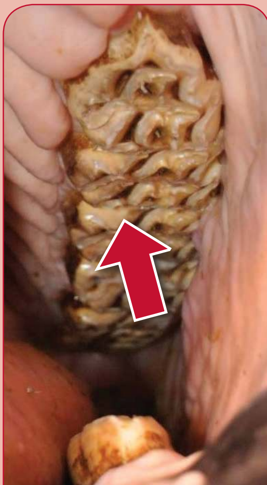
FILLING OF UPPER CHEEK TOOTH

The decayed tooth is drilled out, flushed and filled using specialist equipment.